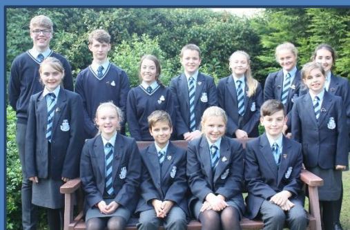
FORM REPRESENTATIVES 2017-2018

We have, therefore, with much regret decided that we cannot pursue our dream of a swimming pool. This is clearly a huge disappointment, but to receive a grant from the government for over £2m is nevertheless something to be celebrated. This grant, however, does not cover the equipment for the sports hall and fitness suite. We have, therefore, decided to use the campaign funds to fully equip the sports hall and fitness suite with state of the art equipment and develop a high quality all-weather area for sports such as netball and tennis.